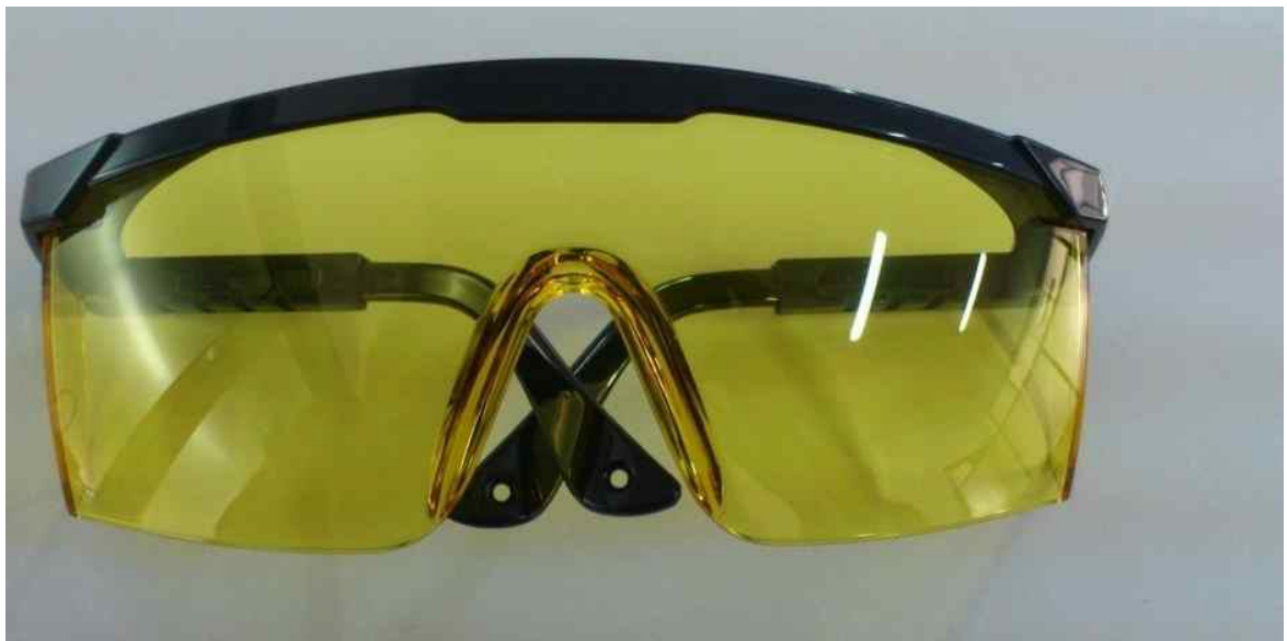
Standard UV Goggle (Included as standard package)